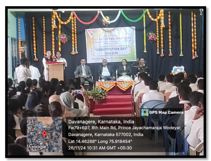
Invocation song by Students