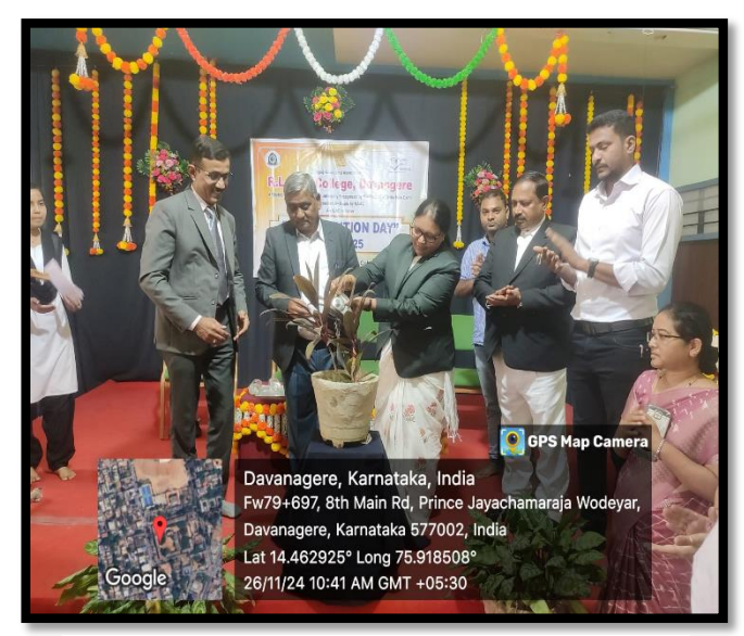
Inauguration by watering the plant by the Dignitaries