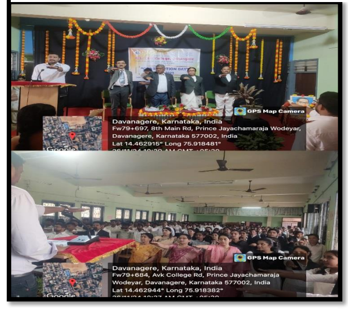
Preamble reading by all