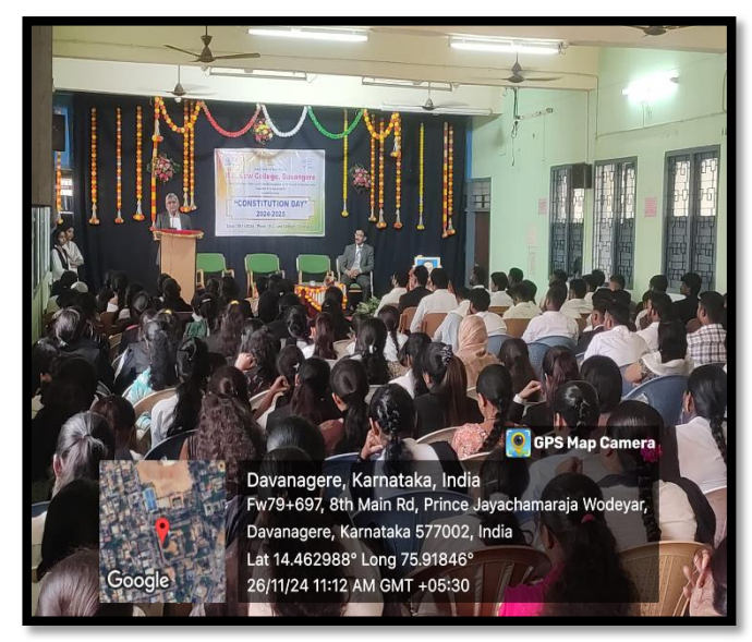
Hon'ble Justice H. Billappa, Former Judge, High Court of Karnataka addressed the gathering