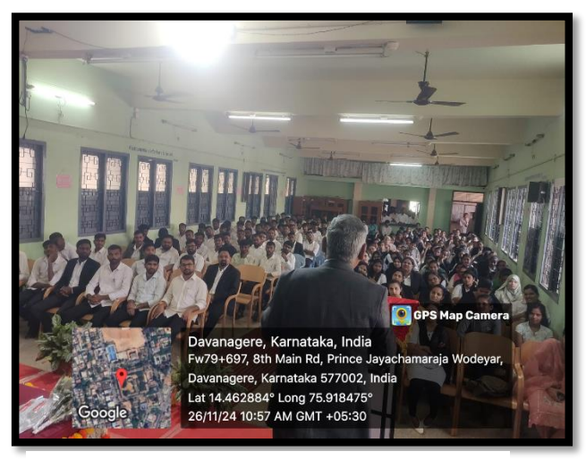
Students presence in the programme